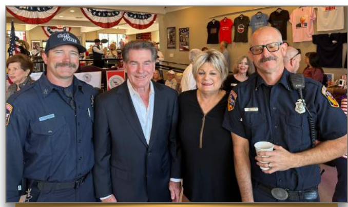
We Appreciate Our Fire Fighters Day at East Valley Palm Desert Headquarters